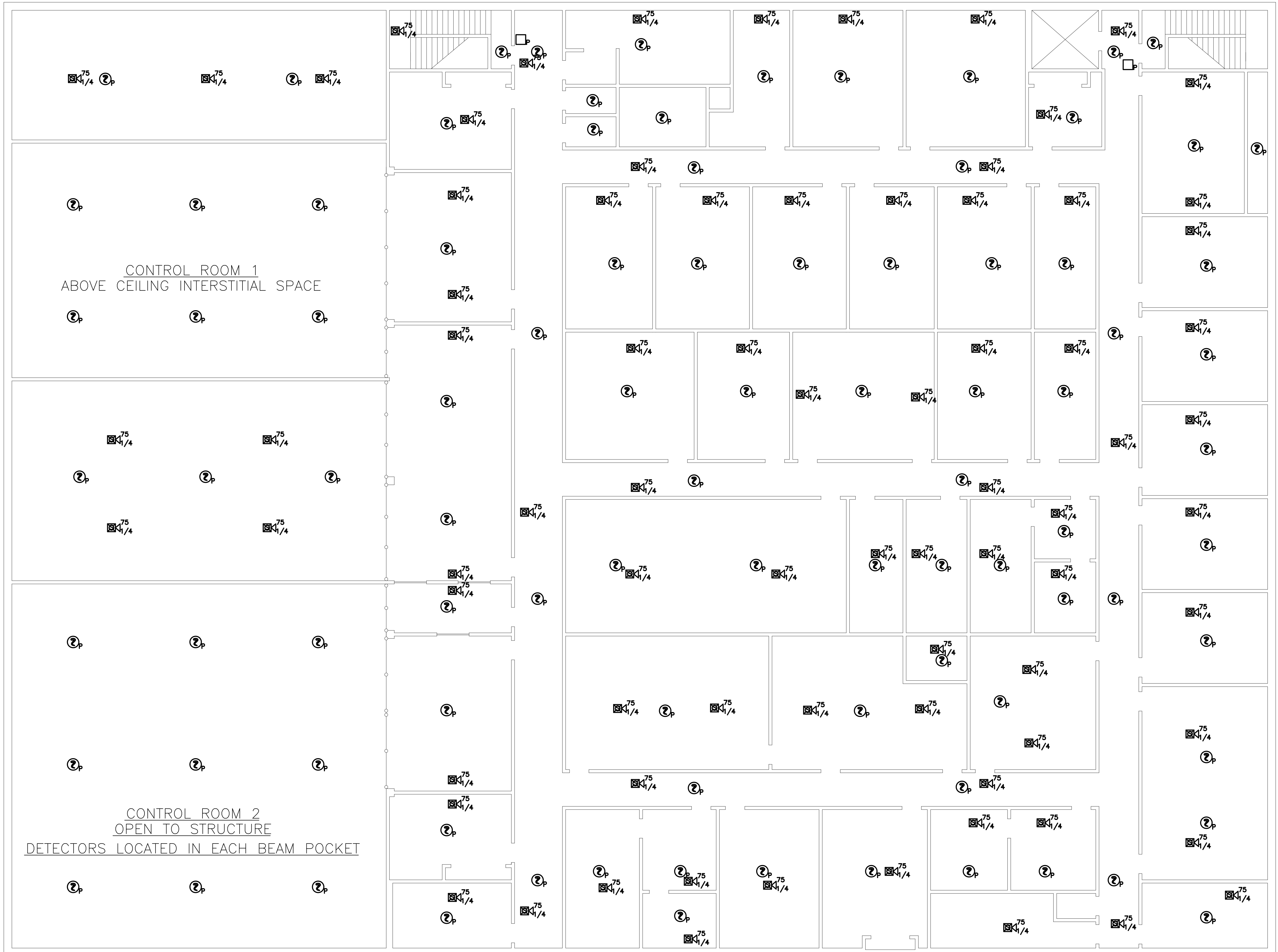
1 SECOND FLOOR FIRE ALARM PLAN FA1.2 SCALE: 1/8" = 1'-0"